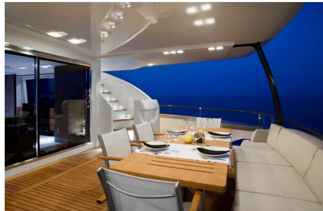
Above & Centre: The Peri 29 is distinguished by her modern sleek lines, vast volumes and strong epoxy composite sandwich structure.