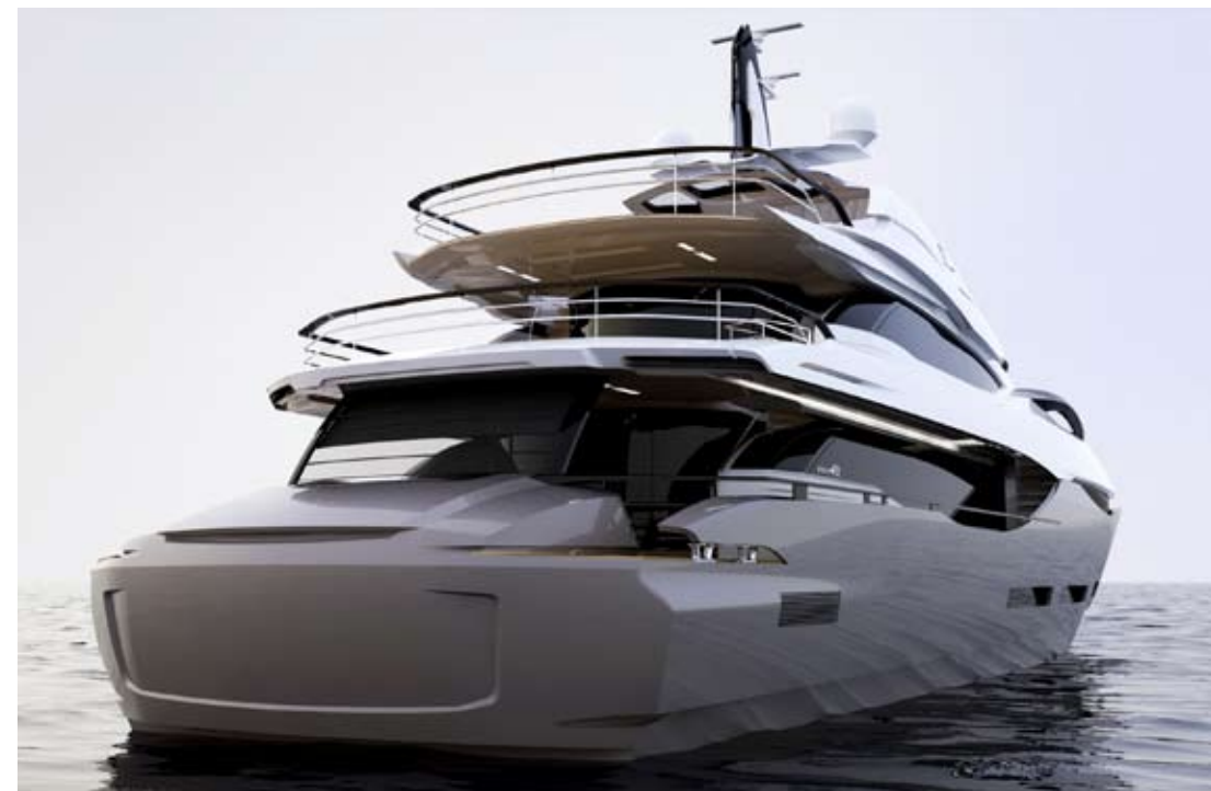
Above, Left & Far Left: The forceful profile and stunning interior space of the Peri 41T are the work of Scaro Design, Turkey's avant-garde design group.