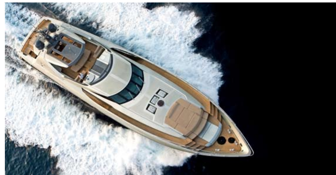
Above: The beautiful, sleek Peri 29 is capable of speeds of up to 28 knots!