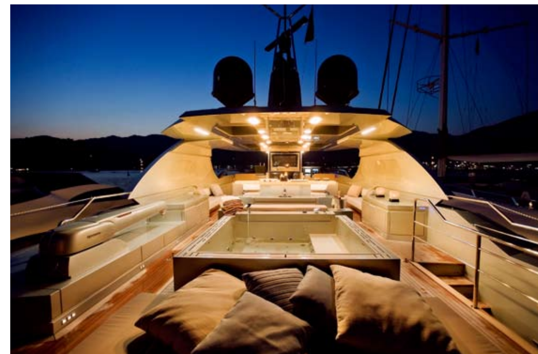
Above, Centre & Far Left: The Peri 37 is a distinctive vessel with her modern sleek lines, vast volumes and strong epoxy composite sandwich body reinforced with carbon fibre.